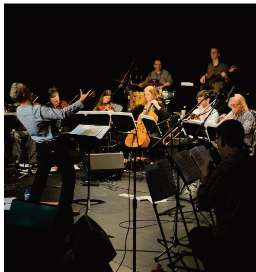
Manchester Evening News